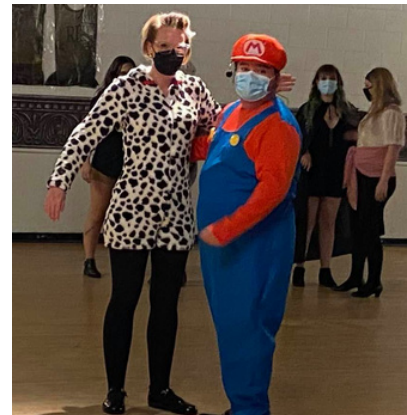
Beginner lesson at the Halloween dance.

We re-launched Jitterbugs' Night Out on May 14, while Omaha was still under a mask mandate. The mandate ended May 31, but when COVID numbers began to rise again in September, Omaha Jitterbugs instated a mask requirement. We celebrated Jitterbugs' 21st birthday, Halloween, and Veterans Day at special JNO events